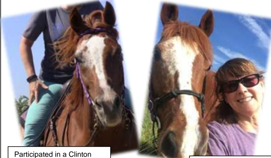
Participated in a Clinton Anderson clinic in Gilroy