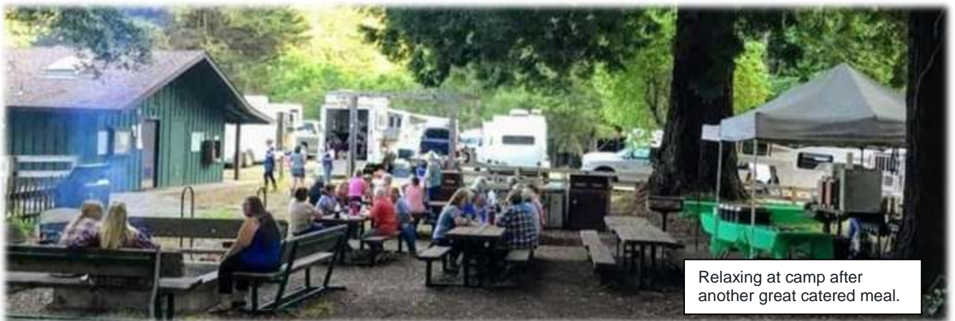
Relaxing at camp after another great catered meal.