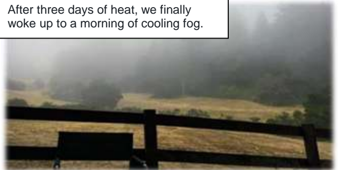
After three days of heat, we finally woke up to a morning of cooling fog.