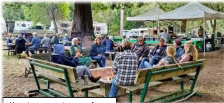
Hanging out at the campfire