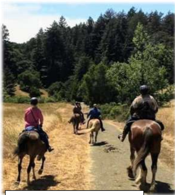
Heading out for our first ride of the trip