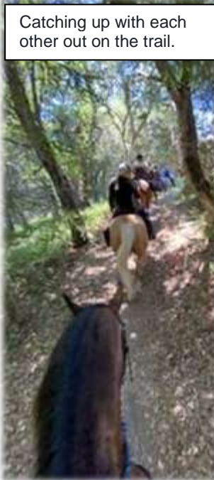
Catching up with each other out on the trail.