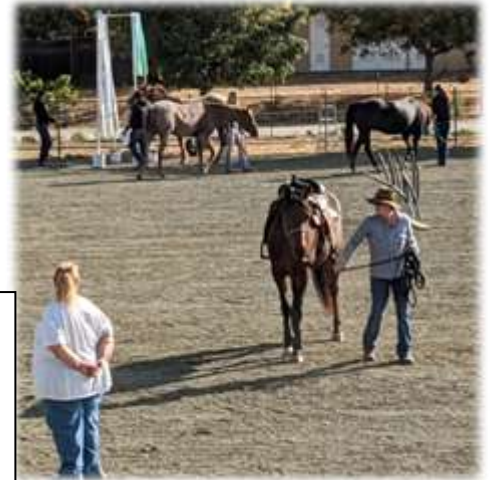
Pictures from practice where people can ride or start off showing the obstacles with their horse in-hand.