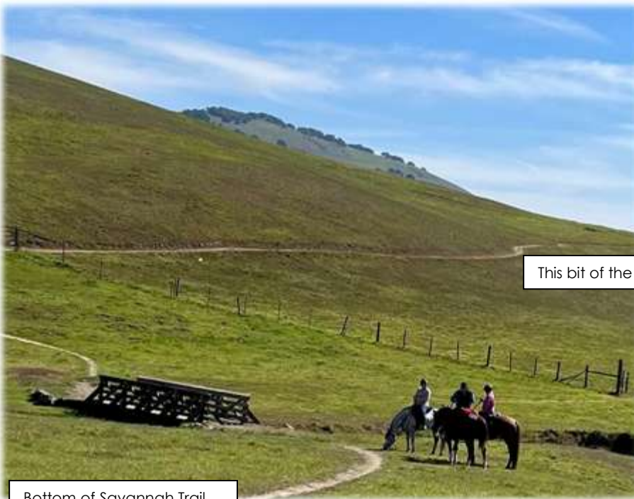
This bit of the Savannah Trail