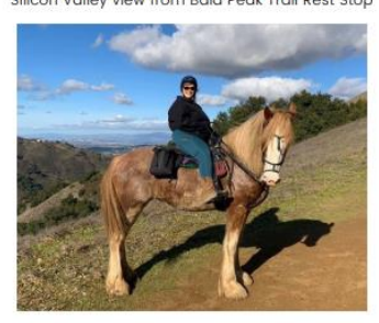
Calero County Park