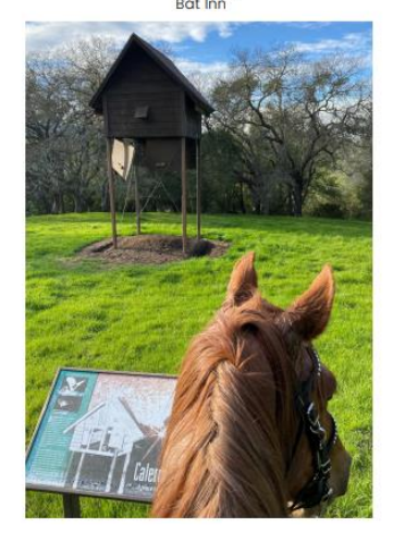
Complete by December 1st 2023