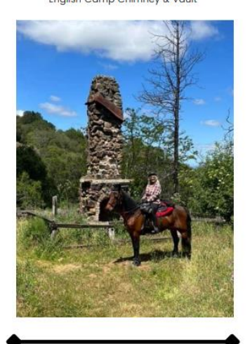
Henry W. Coe State Park - Hunting Hollow

Almaden Quicksilver County Park English Camp Chimney & Vault