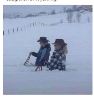
This is why Shetland ponies never caught on in Wyoming.

Maintaining 342 miles of trails in a beautiful and safe condition requires a committed team of crew and staff. Our crew greatly appreciates willing volunteers to join us, get active, and collaborate with us in ensuring the efficient upkeep of our trails. Sign up for Monthly Trail Days in May, June, and July or a special Trail Work Weekend in partnership with Volunteers for Outdoor California (V-O-Cal) at Sanborn County Park May 19-21.