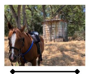
Coyote Lake Harvey Bear Ranch County Park