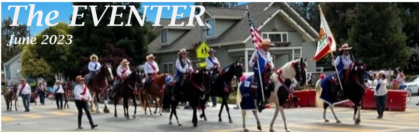
San Martin Horsemen's Association