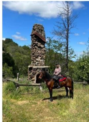
Almaden Quicksilver County Park English Camp Chimney & Vault