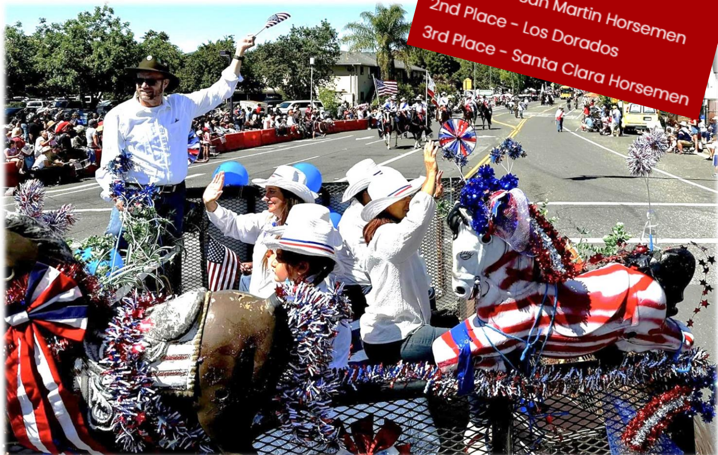
Morgan Hill 4 th of July Parade.

Feel free to contact Board Members directly, or at news@smhorse.org – we look forward to hearing your ideas and having your input!