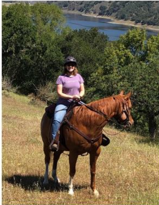
Coyote Lake Harvey Bear Ranch County Park Lake View