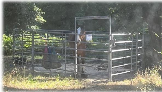
SCCHA also had a Working Equitation clinic on the Saturday