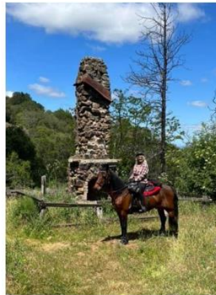
Almaden Quicksilver County Park English Camp Chimney & Vault