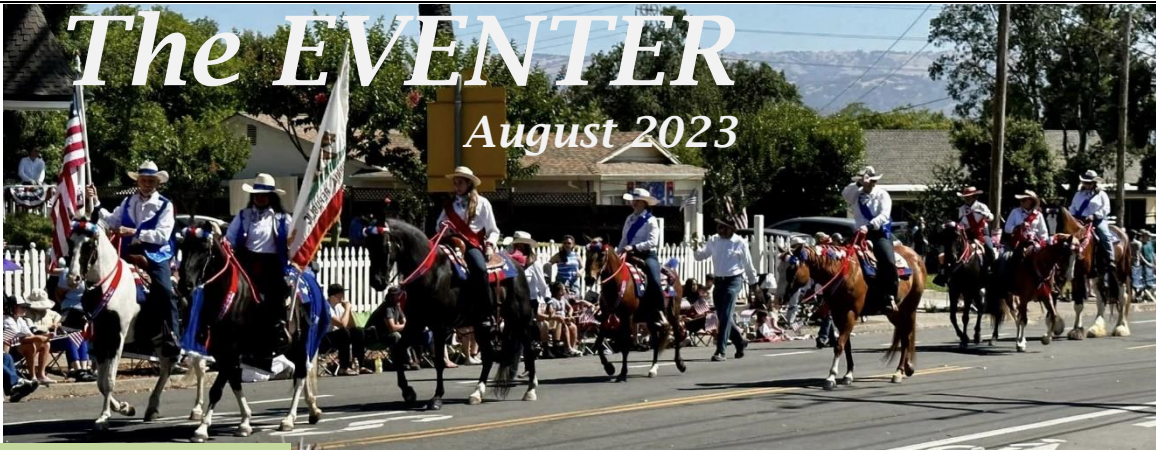
San Martin Horsemen's Association