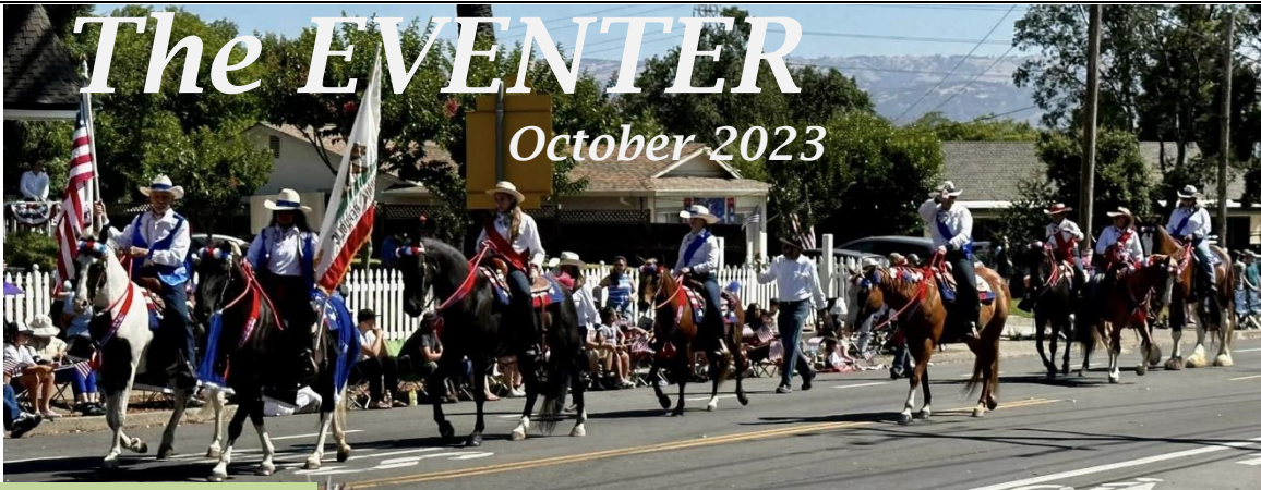
San Martin Horsemen's Association