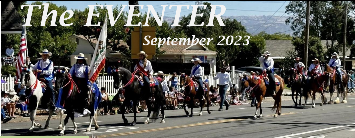
San Martin Horsemen's Association