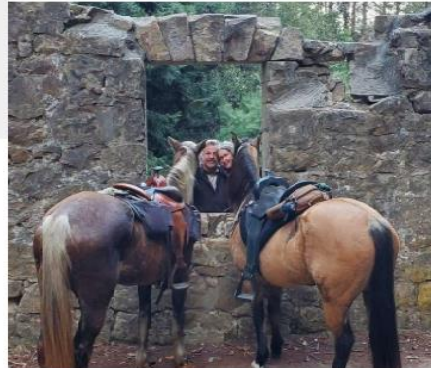
Mt. Madonna County Park Miller House Ruins (between Upper & Lower Miller Trails)