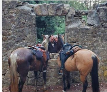
Mt. Madonna County Park Miller House Ruins (between Upper & Lower Miller Trails)